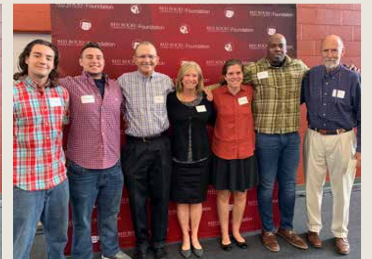
2019 RRCC Foundation Annual Donor Luncheon