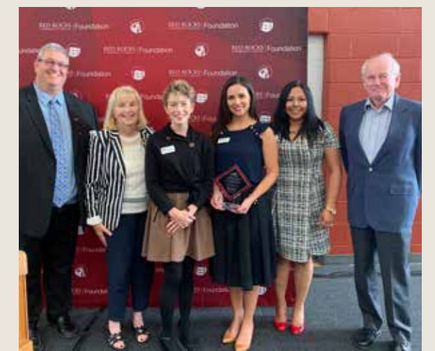
2019 RRCC Foundation Annual Donor Luncheon