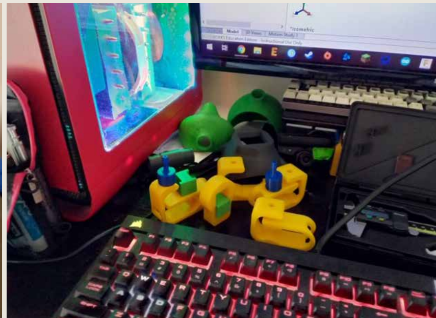
(Left) IDEA Lab designed a two-part air pressure regulator with 3D printed clamps to control air flow to two separate patients using one ventilator. (Right) Students set up makeshift IDEA Lab in their homes to 3D print parts for the ventilator project.