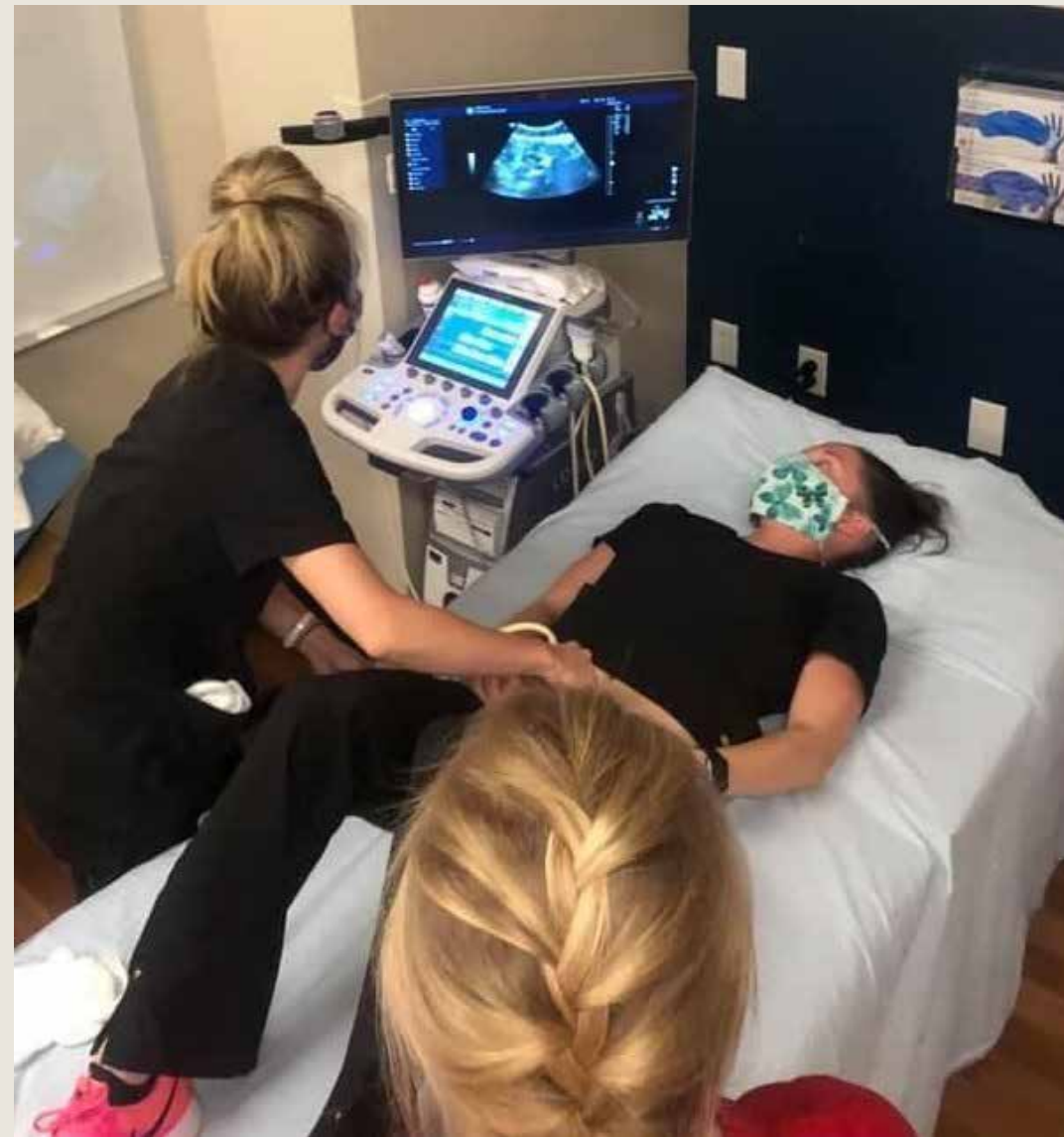
The RRCC Physician Assistant (PA) Program is the only Master degree offering community college PA program in Colorado.

The first cohort of Primary Care Fellows will graduate in November 2020. We are thrilled to partner with the Colorado Health Foundation on this endeavor, and are so grateful to the Colorado Health Foundation’s dedication to improving the health and wellbeing of Coloradans.