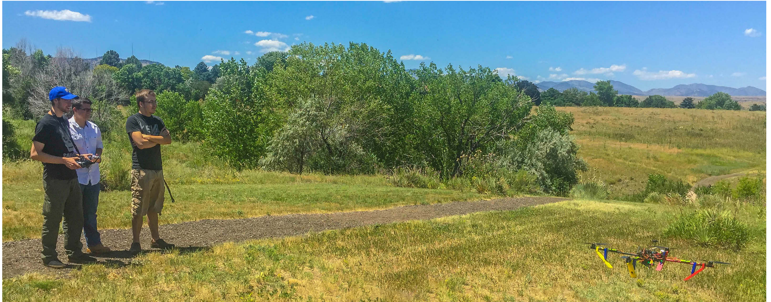
STEM-X STUDENTS DEMONSTRATING THEIR HANDY WORK: THE DRONE PICTURED WILL GO TO GUATAMALA WHERE IT WILL PERFORM GEOLOGIC SURVEYS TO HELP WARN OF LANDSLIDES. THERE IS A REAL POSSIBILITY THIS DRONE WILL SAVE HUMAN LIVES.

Engaged students are more successful in the classroom, take on leadership roles in the college, are more likely to persist, and transfer into STEM degrees at four-year institutions. Red Rocks is taking this to all new heights for pre-engineering and science majors.