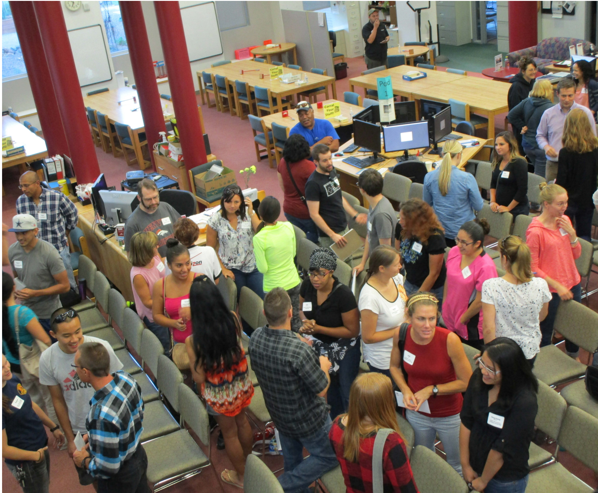
SCHOLARSHIP ORIENTATION IN AUGUST 2015. FOUNDATION SCHOLARS PARTICIPATED IN A STRUCTURED NETWORKING ACTIVITY MEANT TO LAY A FOUNDATION FOR A COMMUNITY OF SCHOLARS.

Last year more than 200 students earned more than $400,000 in scholarships. Emphasis is placed on earned over received because it takes guts for applicants to put their hats in the ring. Each application is carefully read and scored in accordance with the RRCC Foundation's philosophies: it is important that they treat each application as if it were a whole person. It's our version of the golden rule.