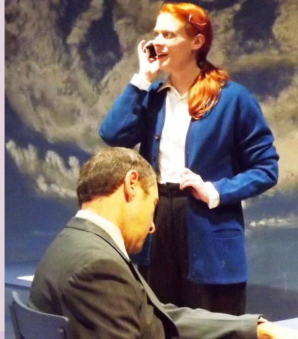
Dead Man's Cell Phone