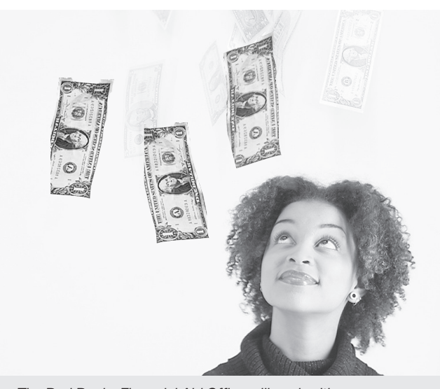
The Red Rocks Financial Aid Office will work with you personally to ensure you receive all the financial aid for which you are qualified.

Once your financial aid file is complete and you have been awarded aid, you may be eligible to charge your books and supplies against your aid (minus your tuition and fees) at the college bookstore. Contact the RRCC Financial Aid Office for additional information.