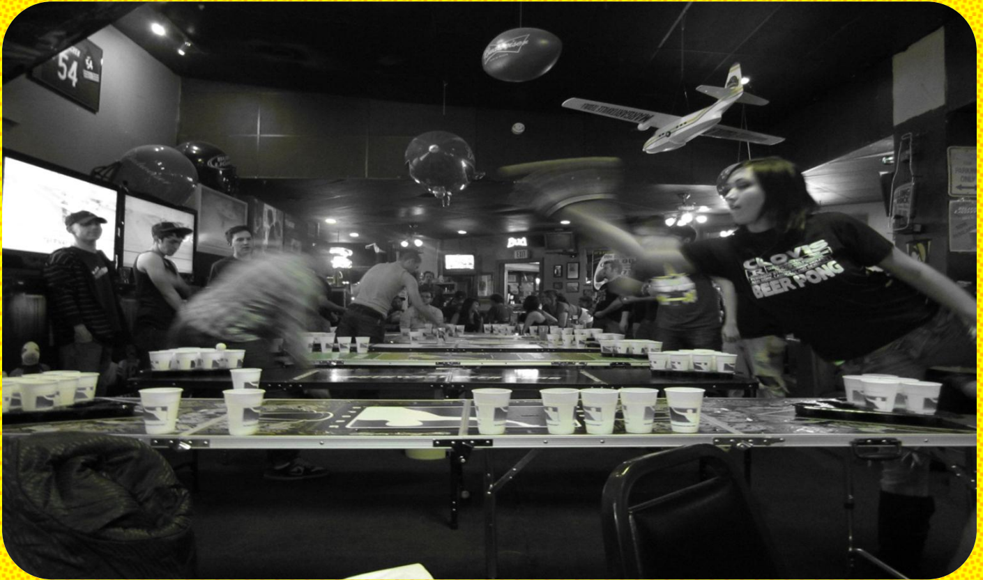
ABOVE: Female beer pong player leans across the table to gain an advantage in a New Mexico WSOBP satellite tournament.