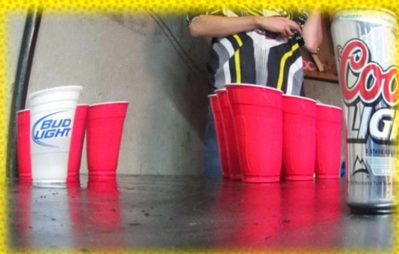
ABOVE: Solo cups typical of house parties.