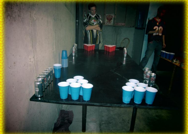
ABOVE: A player waits to play Phoenix Rules, which are the house rules at this party. BELOW: The beer used to play depends on what is available in the homeowner's fridge.