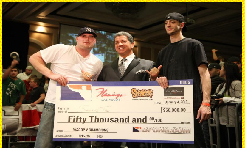
RIGHT: The team, Smashing Time, repeat champions of WSOBP IV, receive the 50K first place check from Bruce Buffer in the WSOBP V.