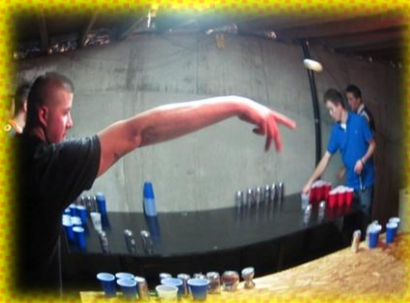
BELOW: After shooting, a player holds his follow-through over a typical house-party table.