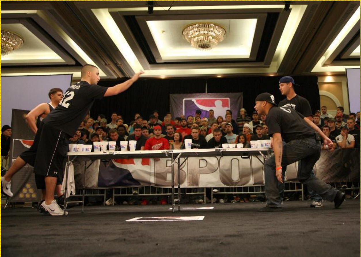
ABOVE: World Series of Beer Pong in Las Vegas, NV- Semi Final game.

Almost all college students in the past fifteen years will tell you that they have played beer pong in someone's basement. However, the game of beer pong has transformed into a sport instead of the drinking game everyone is familiar with.