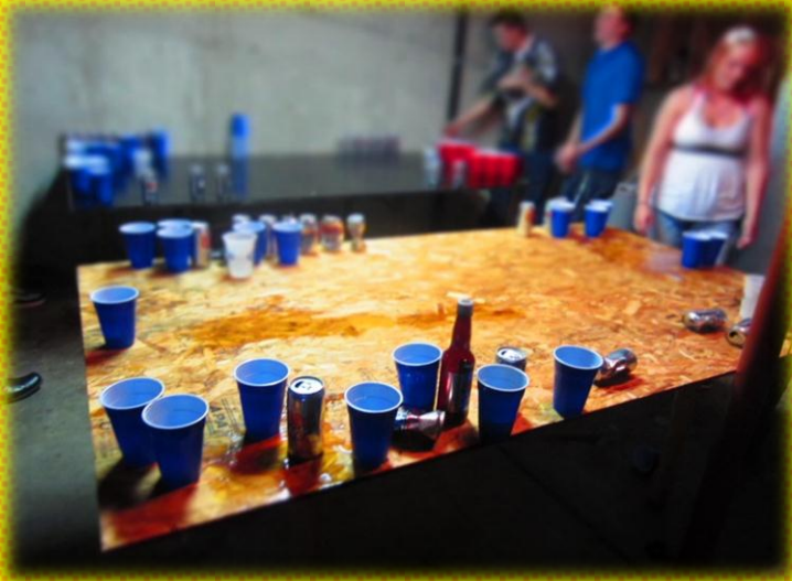
ABOVE: College students play beer pong in a basement.