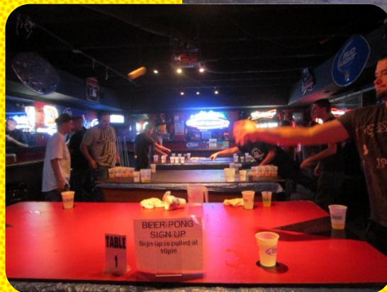
LEFT: Bar tables, cups, and balls vary between bars, but rules are regulated and remain the same at each location.