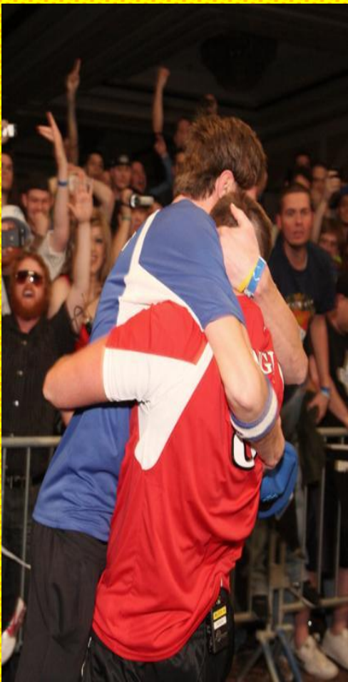
ABOVE: The team Standing Ovation celebrates after winning the WSOBP VI.

Beer pong turned into a professional sport when the World Series of Beer Pong was created by the company BPong. BPong organizes and runs the WSOBP every year in Las Vegas and gives out over $75,000 in cash and prizes (of which the first place team takes home $50,000). They also regulate everything from the rules, to the tables, to the weight and circumference of the ping pong ball. Players across the world come to play in the WSOBP to prove that their skills and techniques are better than those of any of the other competitors. There are several different beer pong tournaments in addition to the actual WSOBP played in Las Vegas, including a coed tournament, East Coast vs. West Coast tournament, female singles tournament, male singles tournament, and an international team tournament. However, winning one of these tournaments is minor in comparison to winning the World Series. The WSOBP transformed the game of beer pong from a drinking activity played in basements, into a highly competitive, international sport, played by hundreds of professional players across the world.