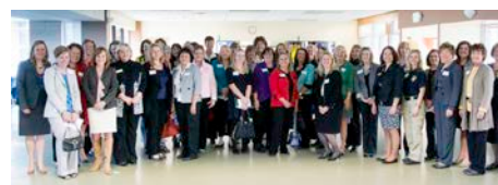
Group Photo of Women Professionals

According to one student, "It was amazing to meet with so many women leaders. They were very encouraging, and open about their career paths." Similarly, the professional women expressed their gratitude for being able to participate and the opportunity to share their experiences with students who were so engaged.