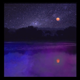
2021 - Dylan Thomas Click for Motion GIF