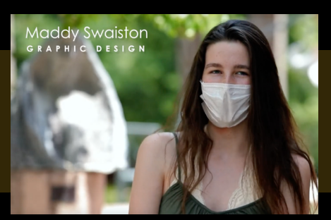
Click for Interview Link &