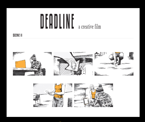
2017 - Scarlett Moody