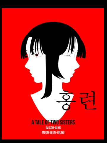
2020 - Fenix Tangkapanya