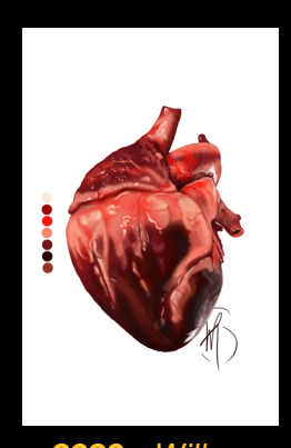
2020 - Willow Rogers