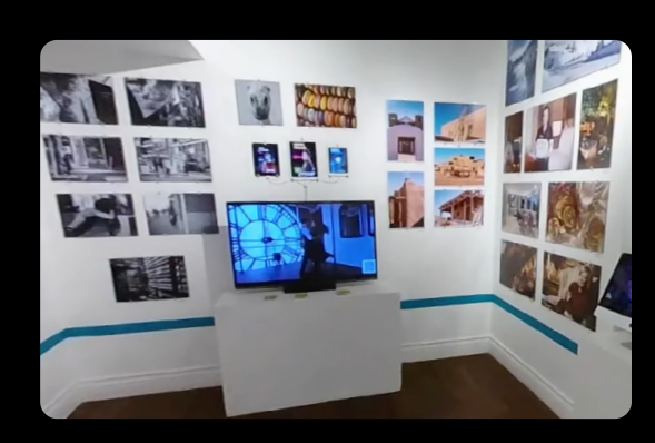
Foothills Art Center 2021 - Photo & Video

www.youtube.com/ watch?v=5_BfpnP4pjl&t=31s