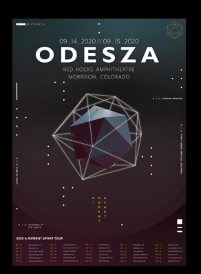
2020 - Ahnia Volkman