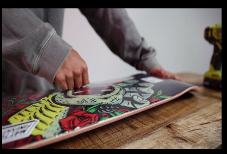
2021 - Travis Avery Click for Video