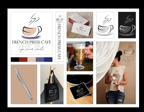
2020 - Willow Rogers