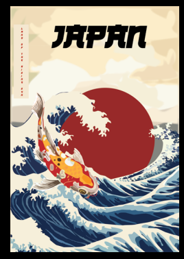
2021 - Mishel Best