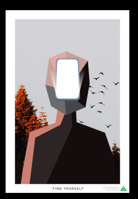
2021 - Joe Swavely