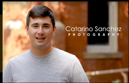
Click for Interview Link &

"It's a good feeling to be in an art gallery multiple times, especially at Foothills, cause it's so local to everything."